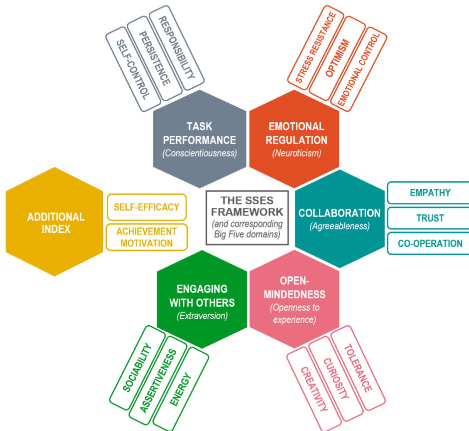
Figure 1. The SSES framework based on the Big Five model of personality